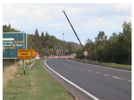
Fig. 3: southern approach to existing temporary A9 diversion